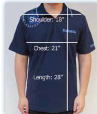
Size of the displayed: M