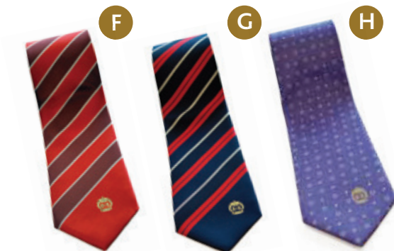
F Red with dark red stripes