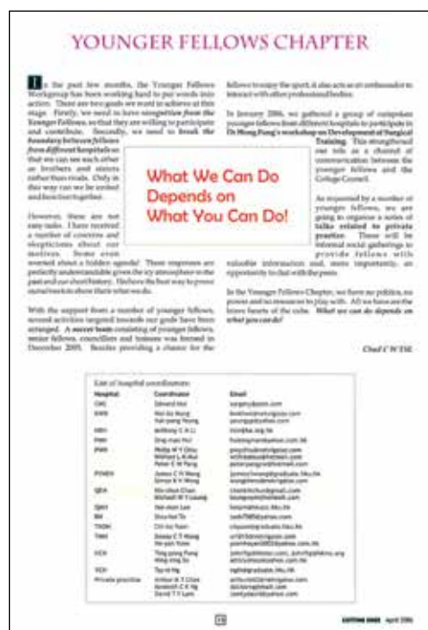
The First Younger Fellows Chapter report in the Cutting Edge (April 2006 issue)

quent cabinets to follow. Over the years, various activities including visiting tours to Macau and Mainland China, tutorials, training courses, career talks and social activities have been regularly organised for our Younger Fellows.